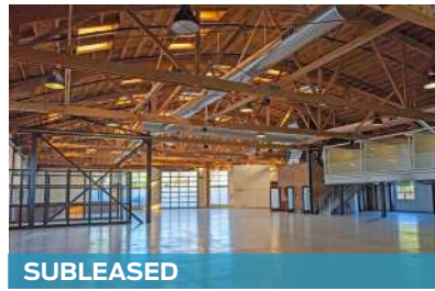
Industrial | 201 W. Montecito St. Santa Barbara · ±12,700 SF 10/3/2024