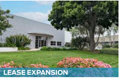
Industrial | 6868 Cortona Dr. Goleta · ±12,669 SF 12/1/2024