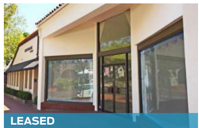
Retail | 1207 State St. Santa Barbara · ±6,000 SF 10/12/2024 (Art Essentials)