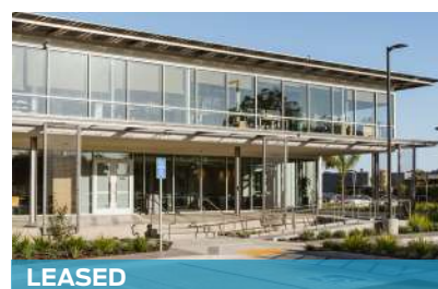
Office | 130 Robin Hill Rd. Goleta • ±11,136 SF 11/25/2024 (Bardex Corporation)